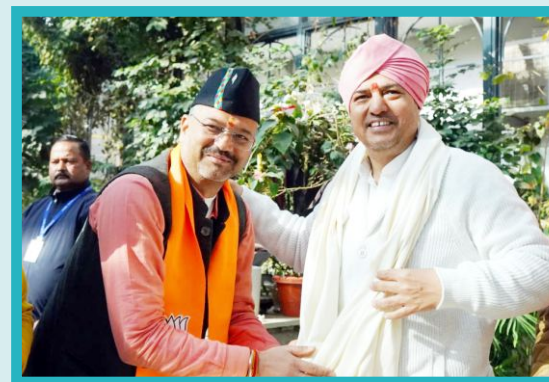
With Shri Saurabh Thapliyal, Mayor, Dehradun