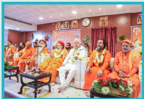
With renowned saints