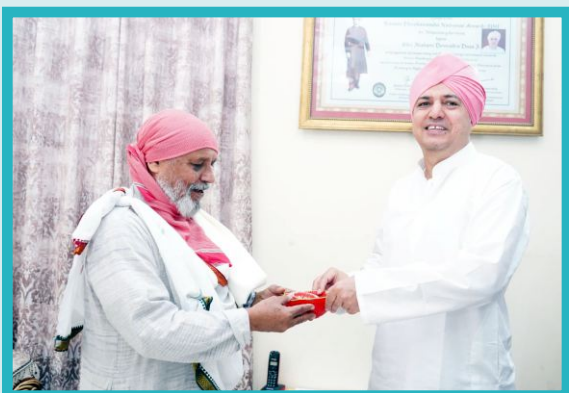
With Padambhushan Dr. Anil Joshi Ji, Environmentalist, Uttarakhand