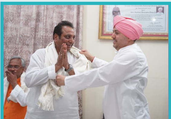
With Shri Vinod Chamoli, Hon. MLA, Uttarakhand