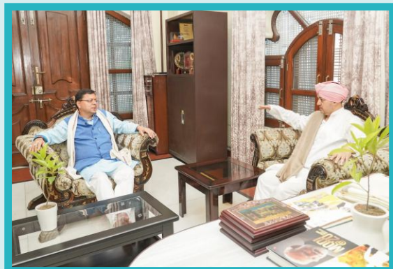
With Shri Pushkar Singh Dhami, Hon. CM of Uttarakhand