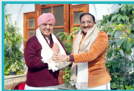
With Shri Ramesh Pokhriyal 'Nishank', Former Chief Minister of Uttarakhand