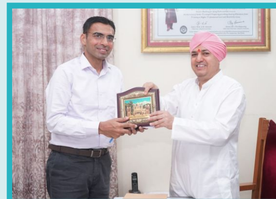
With Shri Savin Bansal, District Magistrate, Dehradun Uttarakhand