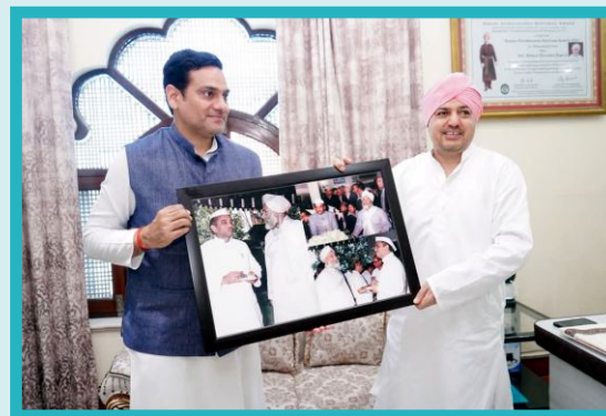
With Shri Saurabh Bahuguna, MLA Uttarakhand