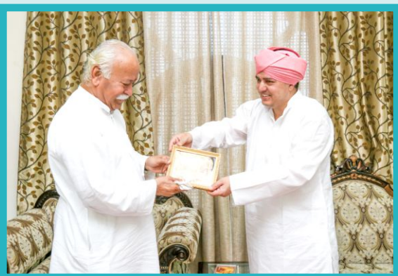
With Shri Mohan Bhagwat Ji, Chief RSS