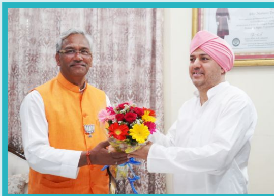
With Shri Trivendra Singh Rawat, Hon. M.P. & Former Chief Minister of Uttarakhand