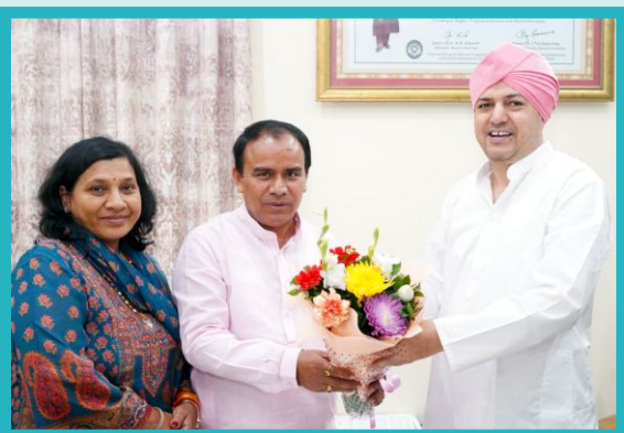
With Dr. Dhan Singh Rawat, Hon. Minister of Uttarakhand