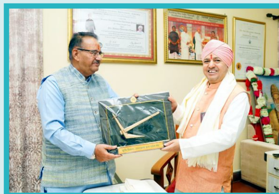
With Shri Ganesh Joshi, Hon. Minister of Uttarakhand